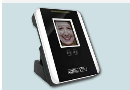
TSE 6120 FACE