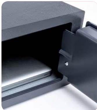
Laptop storage due to the 90° opening giving maximum clearance