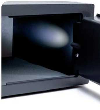
Automatic interior light