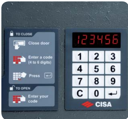
Easy of Use - Operation graphics and ADA compliant Keypad