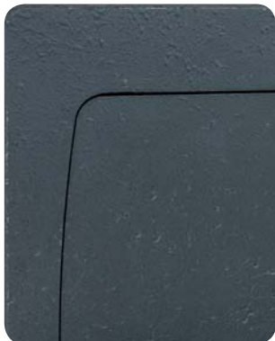
Laser cut for maximum security